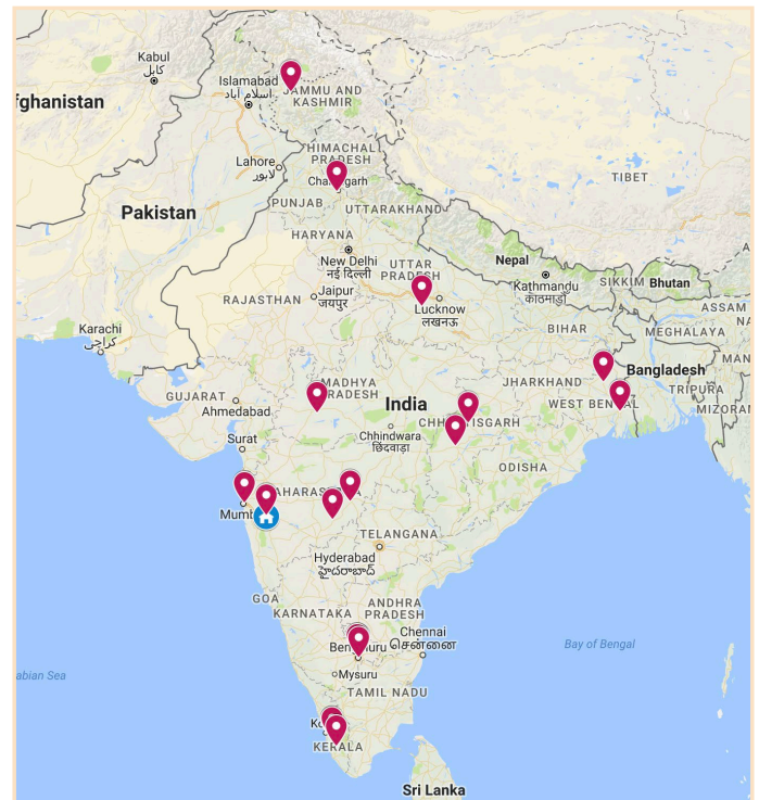
Figure 1: Workshop students came from all corners of India.

As is often the case during CIAO workshops, the learning process was not unidirectional; watching the students learn and search for information, and interact with the soft-