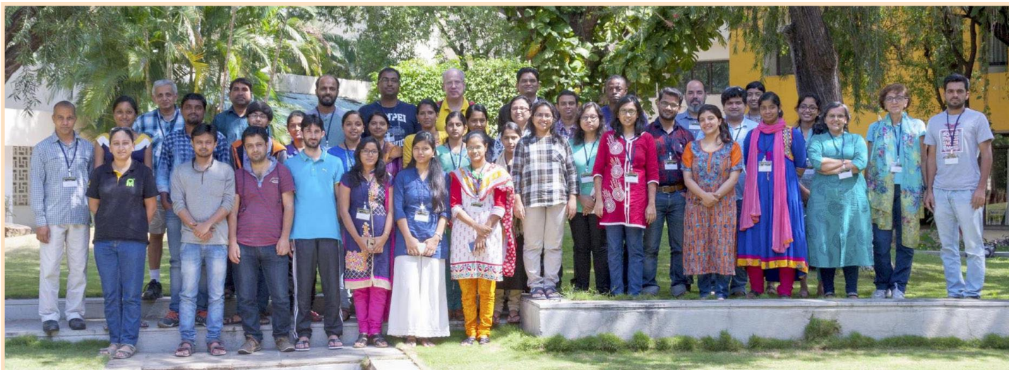
Figure 2: Workshop participants. See http://cxc.cfa.harvard.edu/ciao/workshop/oct17_pune/ for complete workshop information.

particularly interested (for example because of their involvement with the Indian X-ray mission ASTROSAT ) and selecting students from the many applicants. The workshop had no registration fee and all the students were provided room and board and some reimbursement toward travel expenses. Dr. Vir Lal of course took care of us from the time we landed in India to the time we left!